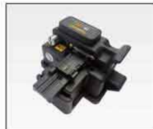
Automatic fiber cleaver TF1201