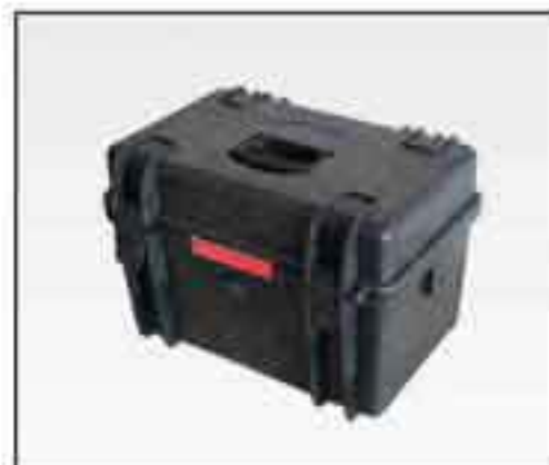
Carrying case MS-30