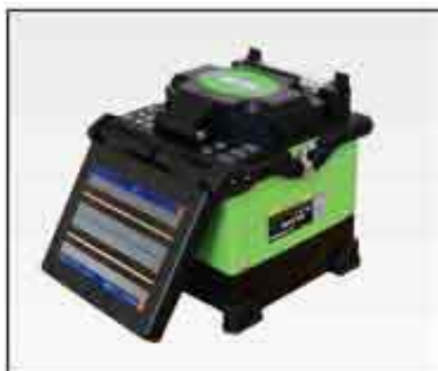
Fiber Fusion Splicer TF1102

Note: At least, The above standard package come with splicer main body.