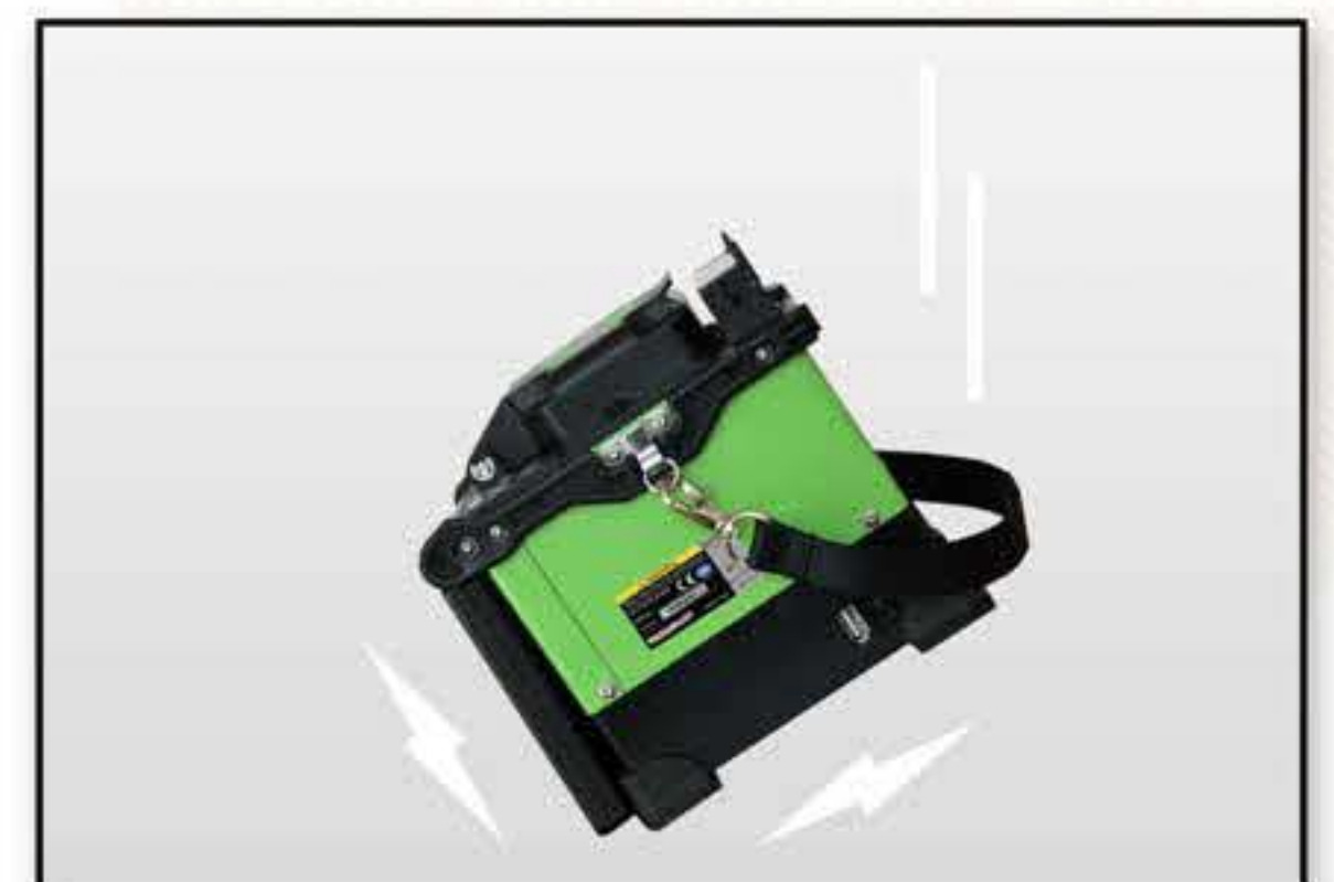
Durable & Rugged