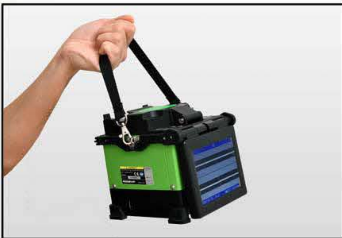
Less than 2kg including battery

Minimal Splice Loss | Proven Reliability | Easy Splice Operation | Great Splice Efficiency