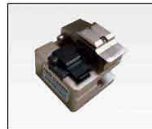
Two step fiber cleaver TF1202