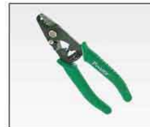
Jacket stripper SMF-30